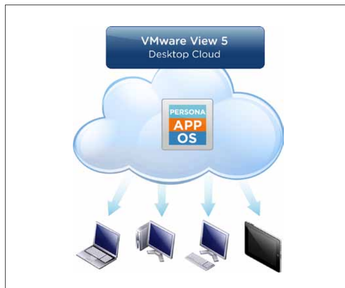
VMware View improves desktop and application management by delivering desktop services from your cloud to enable end users over any network on any device.

Enable a seamless end-user experience across sessions by maintaining the user persona with faster login times. View Persona Management also reduces costs by enabling more cost-efficient, stateless floating desktops.